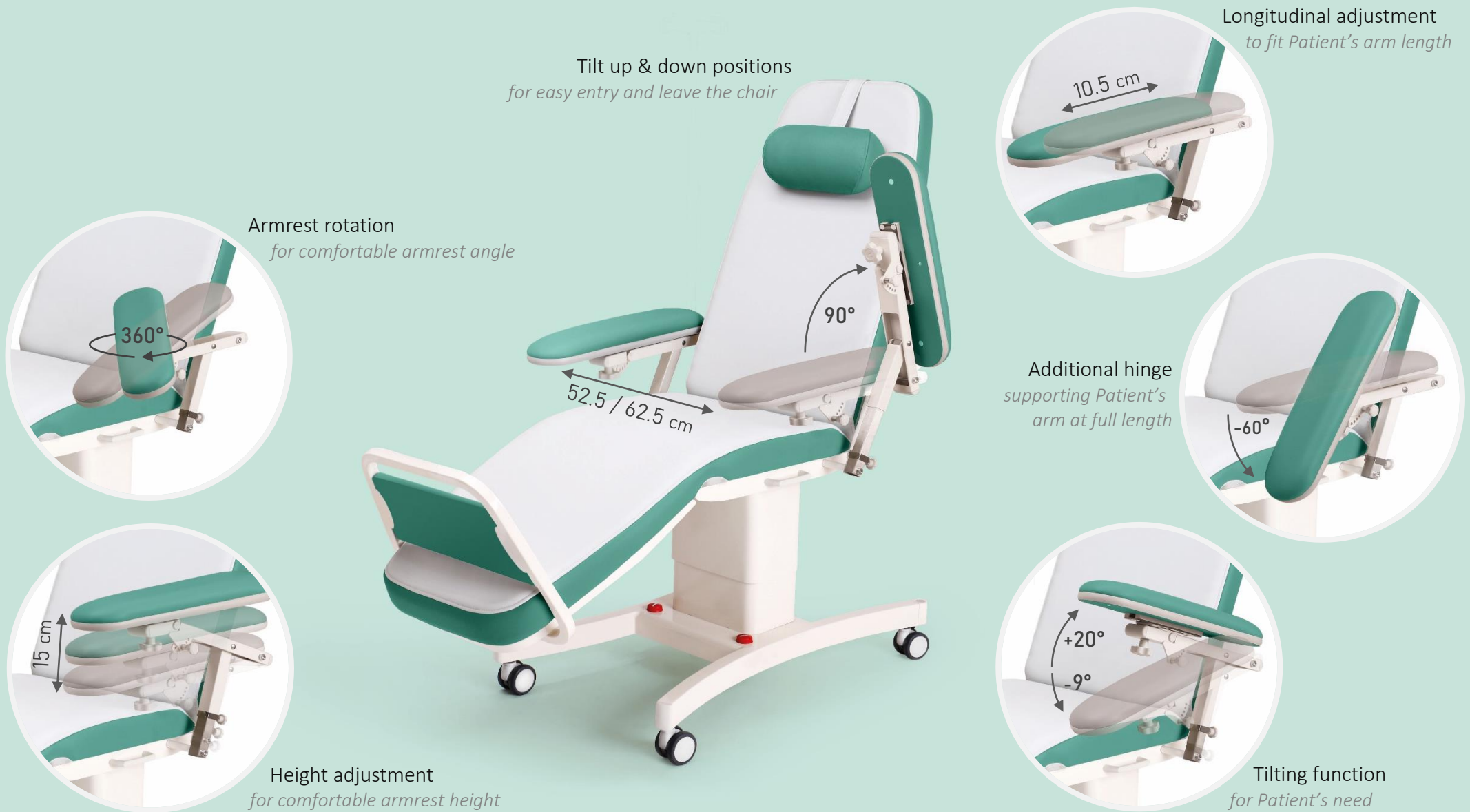
Tilt up & down positions for easy entry and leave the chair