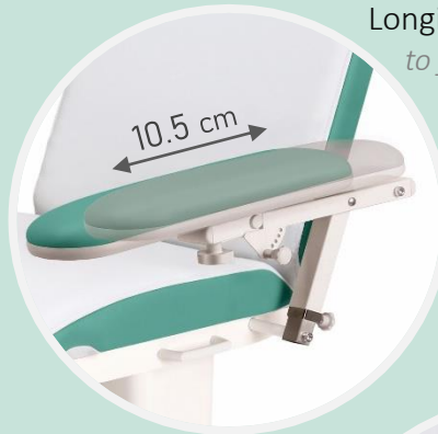
Longitudinal adjustment to fit Patient's arm length