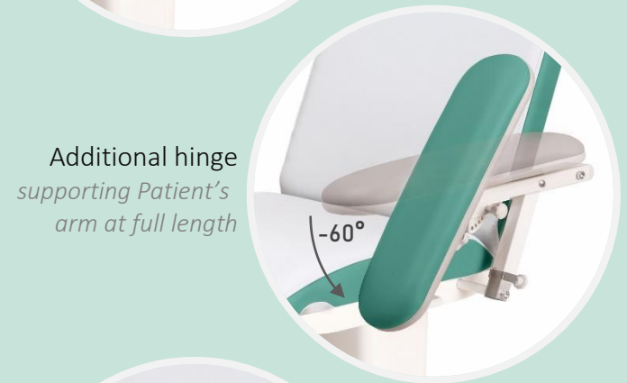
Additional hinge supporting Patient's arm at full length